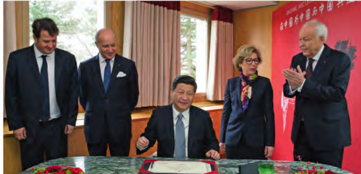
9.05 am/ Private interview and signing of a scroll to commemorate this visit.