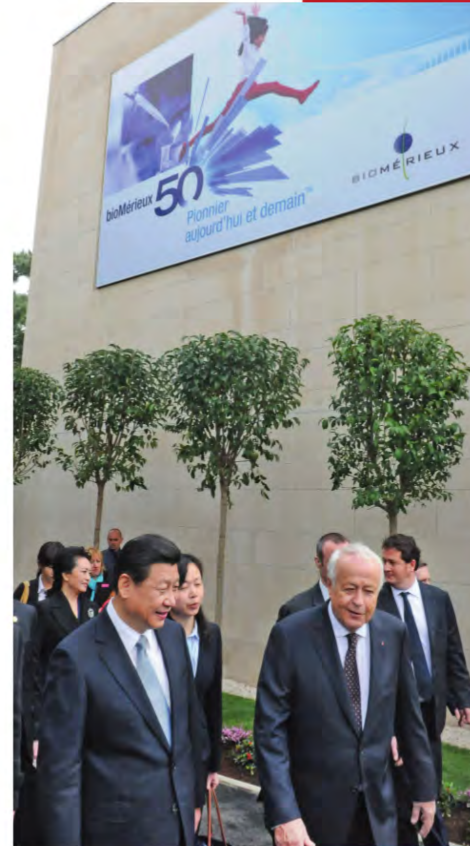
9.45 am/ Departure of the delegation to the Franco-Chinese Institute in Lyon.