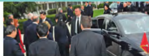
9.00 am/ Arrival of the presidential delegation.